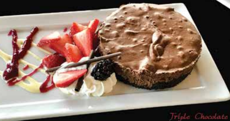
Triple Chocolate Mousse Torte

LOCATED IN THE HILTON BRANSON CONVENTION CENTER HOTEL - 200 EAST MAIN STREET