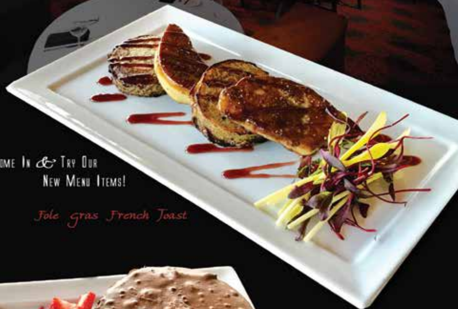
COME IN & TRY OUR NEW MENU ITEMS!