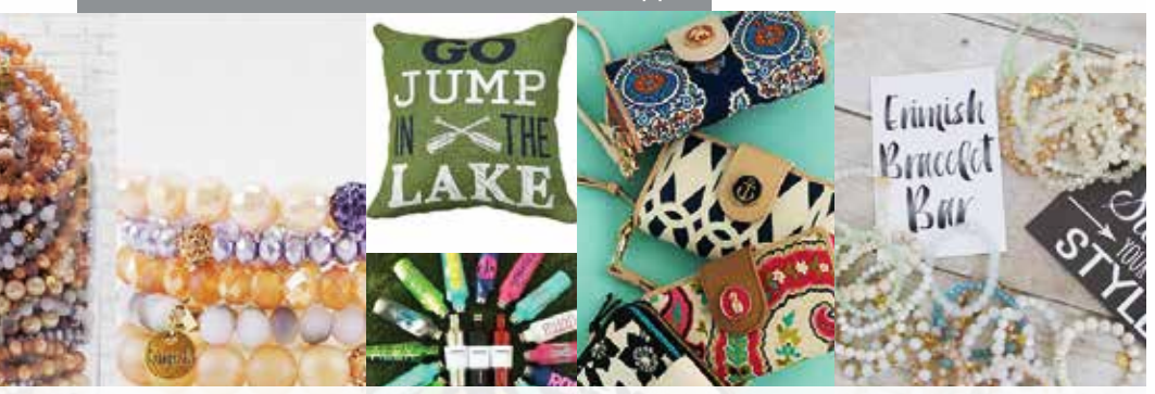
Vera Bradley | Pandora | Swarovski | Locally, Handmade and More

417-335-8236 490 Branson Landing Blvd, Suite 301